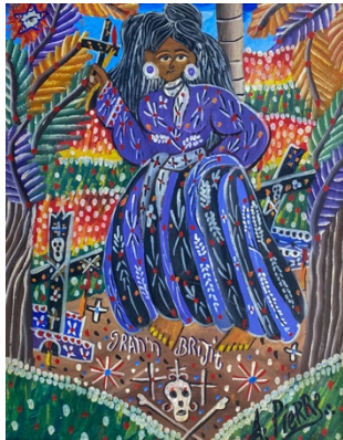
Figure 1:Grann Brijit. Painting by Andre Pierre

https://lequotidiendhaiti.com/le-canada-sanctionne-deux-politiciens-haitiens-et-ouvre-un-bureau-pour-la-police-nationale-dhaiti-en-republique-dominicaine/