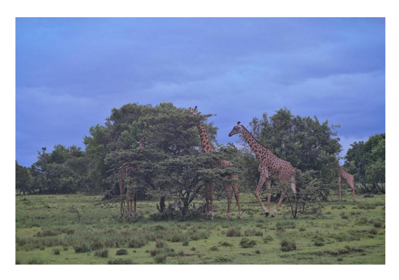
Outside of the reserve giraffes take their time—to browse, to roam