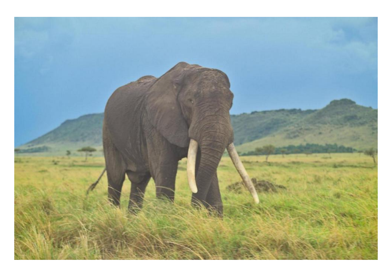
Photographs unable to capture how tender her eyes are rely on precious imagination