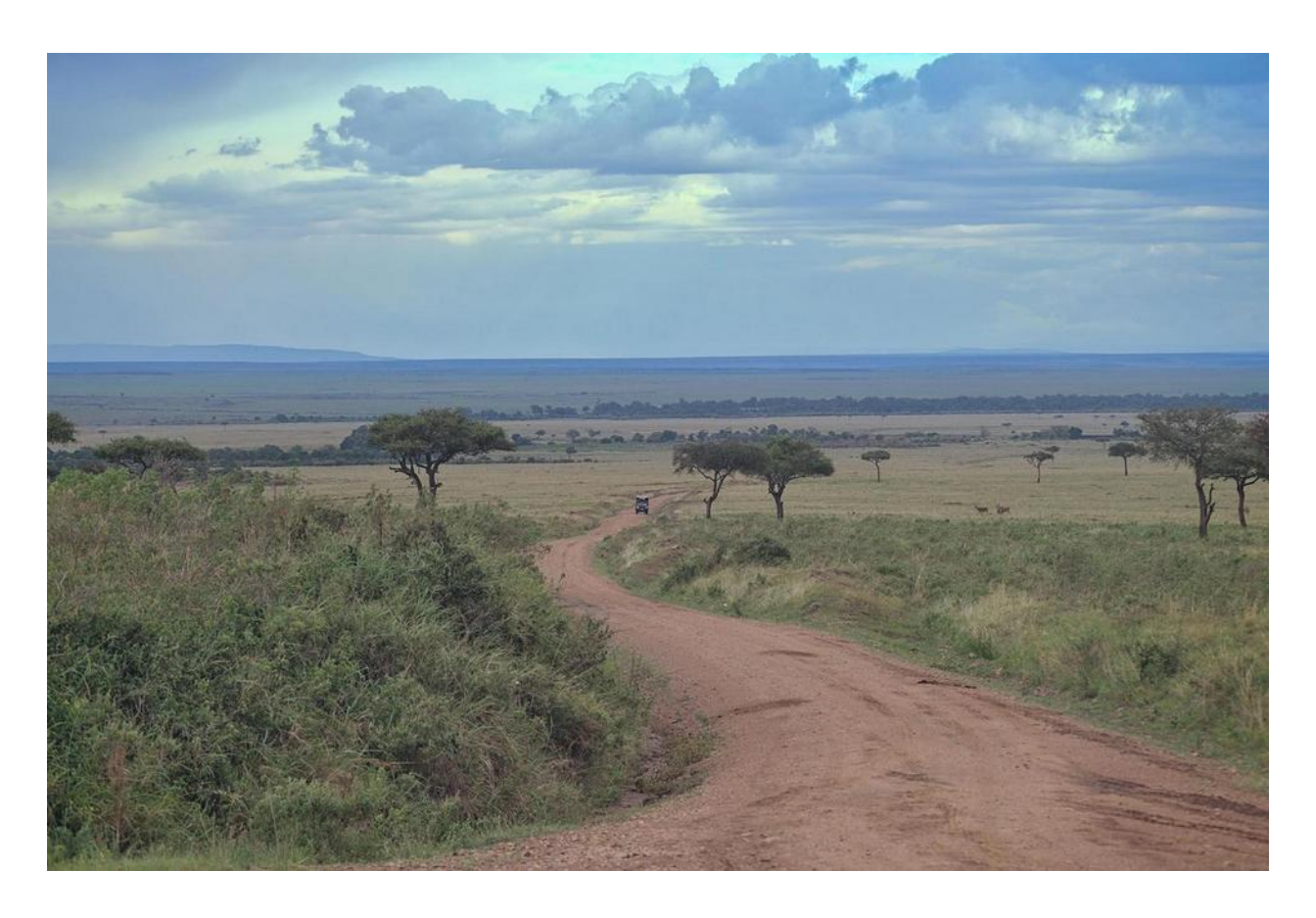
There's always a road which leads to where we go and where we must return