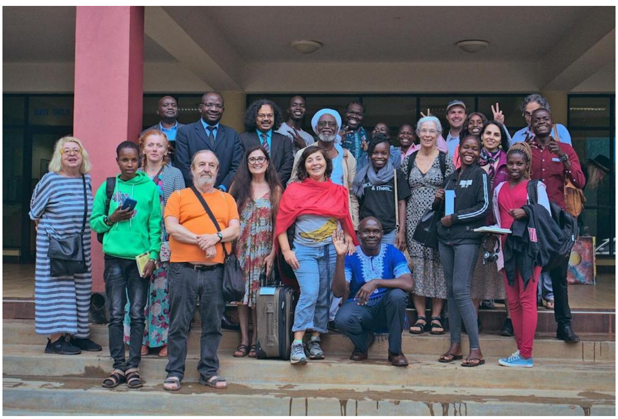
2023 Kistrech International Poetry Festival poets with Kisii University Deputy Vice Chancellor and students

Another thing about the trip is that the end of the festival doesn't have to be the end of the festival. In the spirit of showing off Kenya's beautiful nature, people, hospitality, and fellowship, there's another day of travel for those interested and with time permitting: the day trip to Maasai Mara National Reserve. The savannah preserve and its wildlife is one of the largest tourist attractions in Kenya.