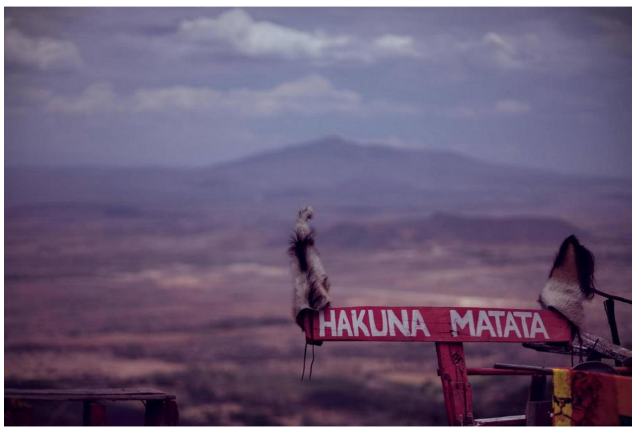
Great Rift Valley viewpoint on the road from Nairobi to Kisii

Between the two, there will be opportunities to see parts of the Great Rift Valley, to share stories with poets from different corners of the globe, to speak and listen in multiple tongues, to learn to look across the jagged-smooth face of escarpment like a lover who you know could kill you if you make the wrong move and neither of you could possibly care less. I had read about gasping at beauty but never done it. Did I do it the first time ever, I saw your face? Did you do it?