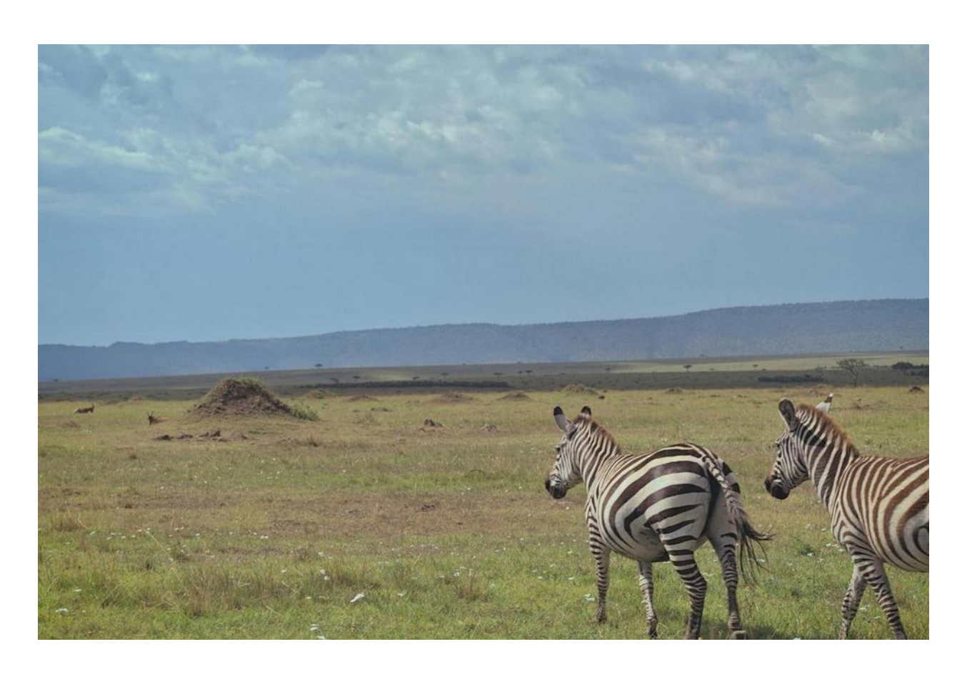
The gleam of zebra stripes in the sun is an unexpected, welcome kiss